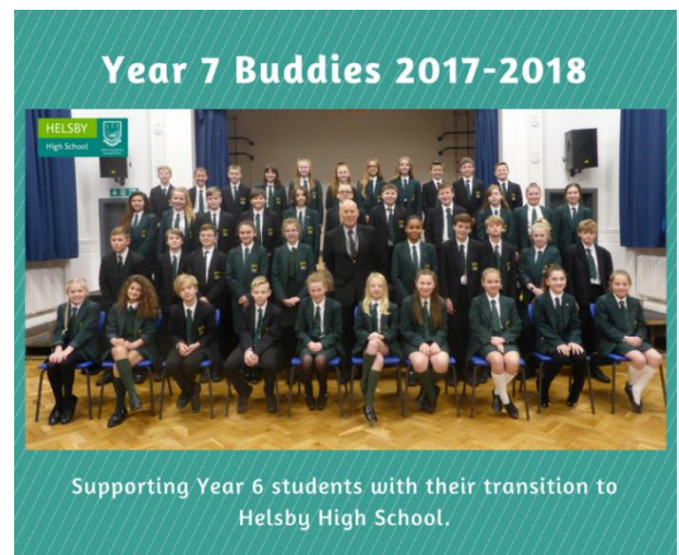
Supporting Year 6 students with their transition to Helsby High School.

Over the last few weeks our staff and Y7 E-buddies have been busy visiting our partner primary schools and in early July we held very successful transition evenings and two transition days. We have had a lot of very positive feedback about the transition arrangements and I would like to thank all the staff and student leaders for making these events run so smoothly. We shall have a full year 7 group joining us in September 2018 and they will be the first to wear the new style school uniform. All other year groups will stay with the existing uniform as they move through school.