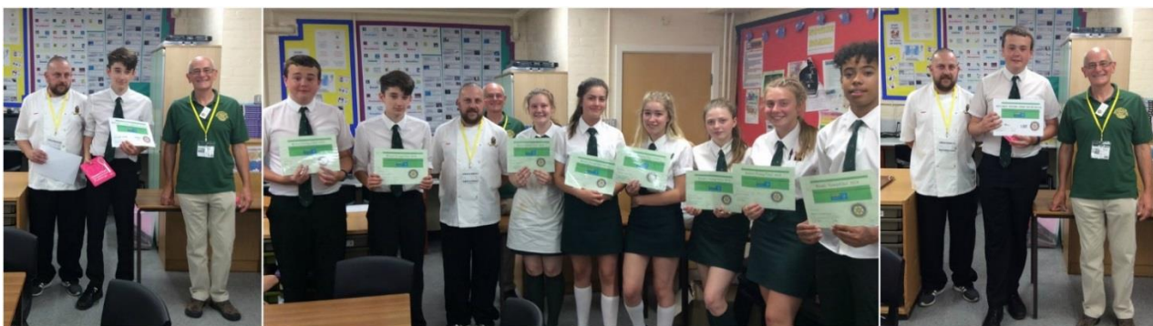
Frodsham & Helsby Rotary Club Young Chef competition

Over the summer our students have been involved in a wide range of educational visits and events. There are too many to mention them all here but they are celebrated in more detail via our popular social media outlets. I know how impressed Ofsted and other visitors to the school are by the range of character-building events our young people are involved in.